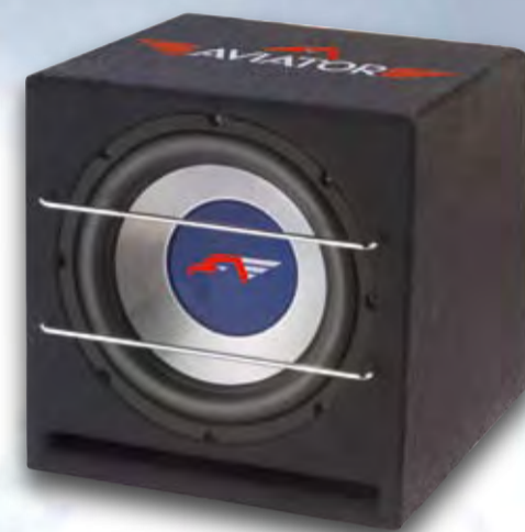
AE 301 300mm or 12", HEAVY DUTY LARGE EXCURSION DRIVER, ALUMINIUM COATED PP DRIVER CONE, 300W RMS SUGGESTED POWER AMPLIFIER, 600W PEAK POWER, 4 OHM NOMINAL IMPEDANCE, 32 Hz LOW END RESPONSE 91.8 dB 2.83V SENSITIVITY, THICK MDF CABINET WITH BLACK/BLUE CARPET, CAD OPTIMIZED HIGH FLOW VENTED TUNNEL