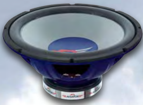
AW 300 300mm or 12", 4 OHM, 150W RMS, 300W PEAK