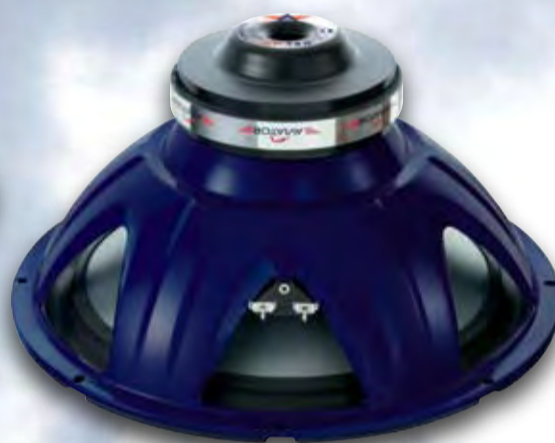
AW 380 380mm or 15", 4 OHM, 250W RMS, 500W PEAK