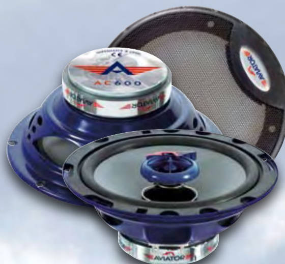
AC 600 FULL RANGE 165mm or 6.5", 40W RMS, 90W PEAK