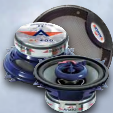
AC 400 FULL RANGE 100mm or 4", 20W RMS, 60W PEAK