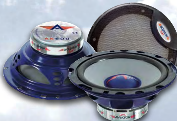
AK 600 2-WAY 165mm or 6.5", 60W RMS, 120W PEAK