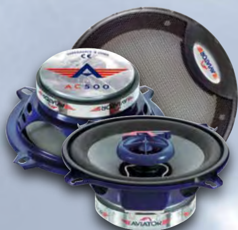
AC 500 FULL RANGE 130mm or 5.25", 30W RMS, 75W PEAK