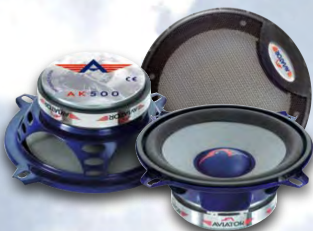
AK 500 2-WAY 130mm or 5.25", 50W RMS, 100W PEAK