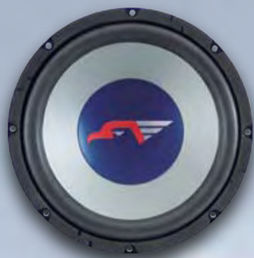
AW 250 250mm or 10", 4 OHM, 125W RMS, 250W PEAK