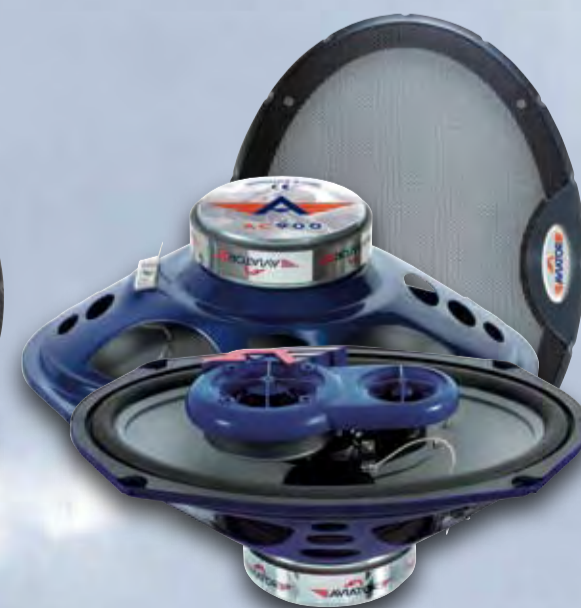
AC 900 FULL RANGE TRIAXIAL 150x230mm or 6"x9", 50W RMS, 120W PEAK