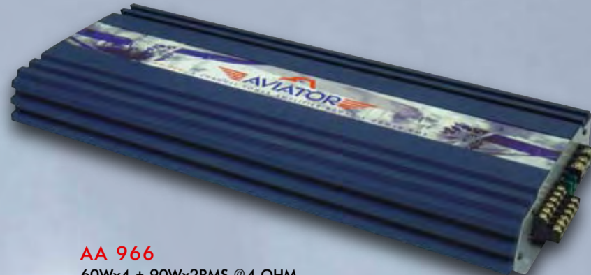
AA 966 60Wx4 + 90Wx2RMS @ 4 OHM 90Wx4 + 130Wx2RMS @ 2 OHM 180Wx2 + 260Wx1RMS @ 4 OHM MONO BRIDGED